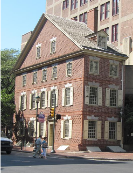
House where Thomas Jefferson wrote Declaration of Independence