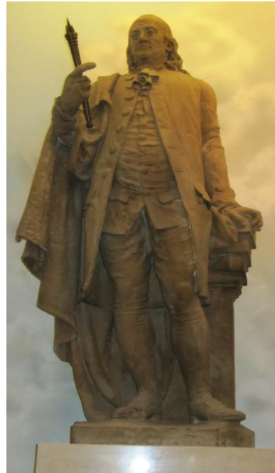
Benjamin Franklin Statue