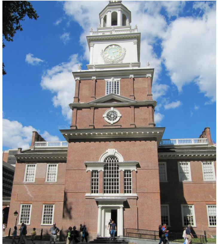
Pennsylvania State House, now Independence Hall

Assembly Chambers where Declaration and Constitution were debated & approved