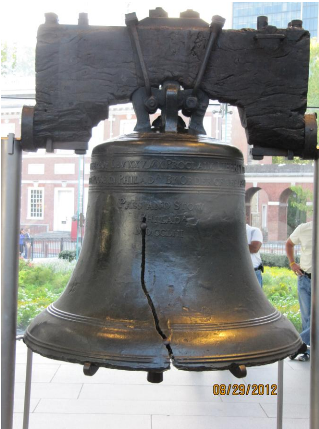
The REAL Liberty Bell