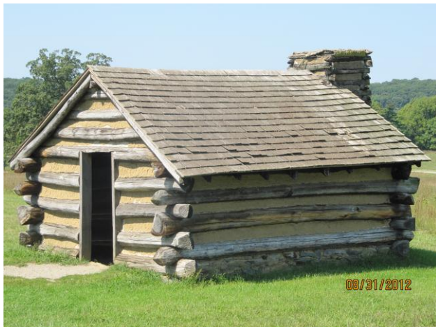
Valley Forge- Following their arrival on Dec. 19, 1777, the men started building cabins, 14x16 feet, A door and a fireplace. Almost 2000 cabins built. Below-Inside cabin