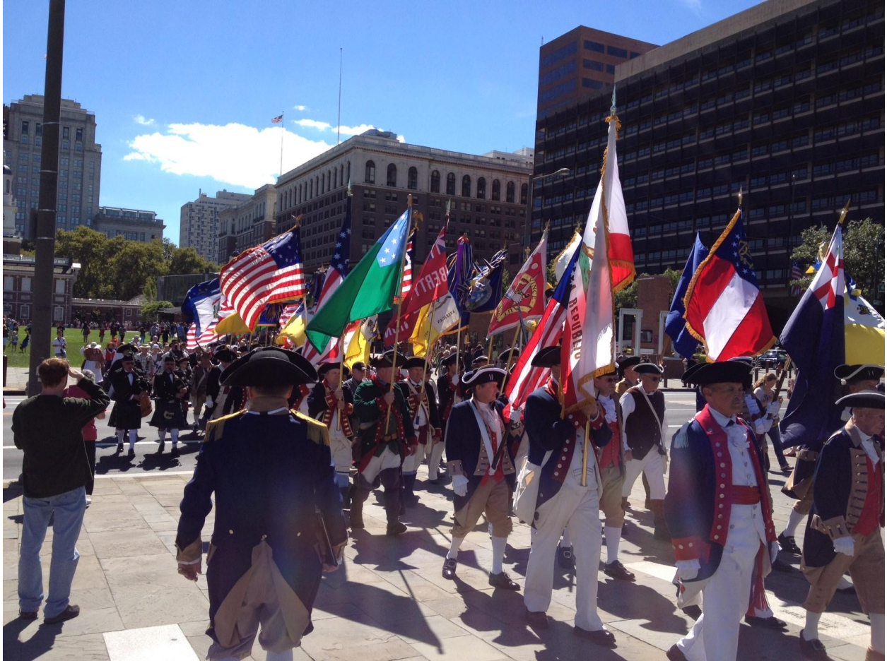
Color Guard Marching from Independence Hall to Constitution Hall in Philadelphia