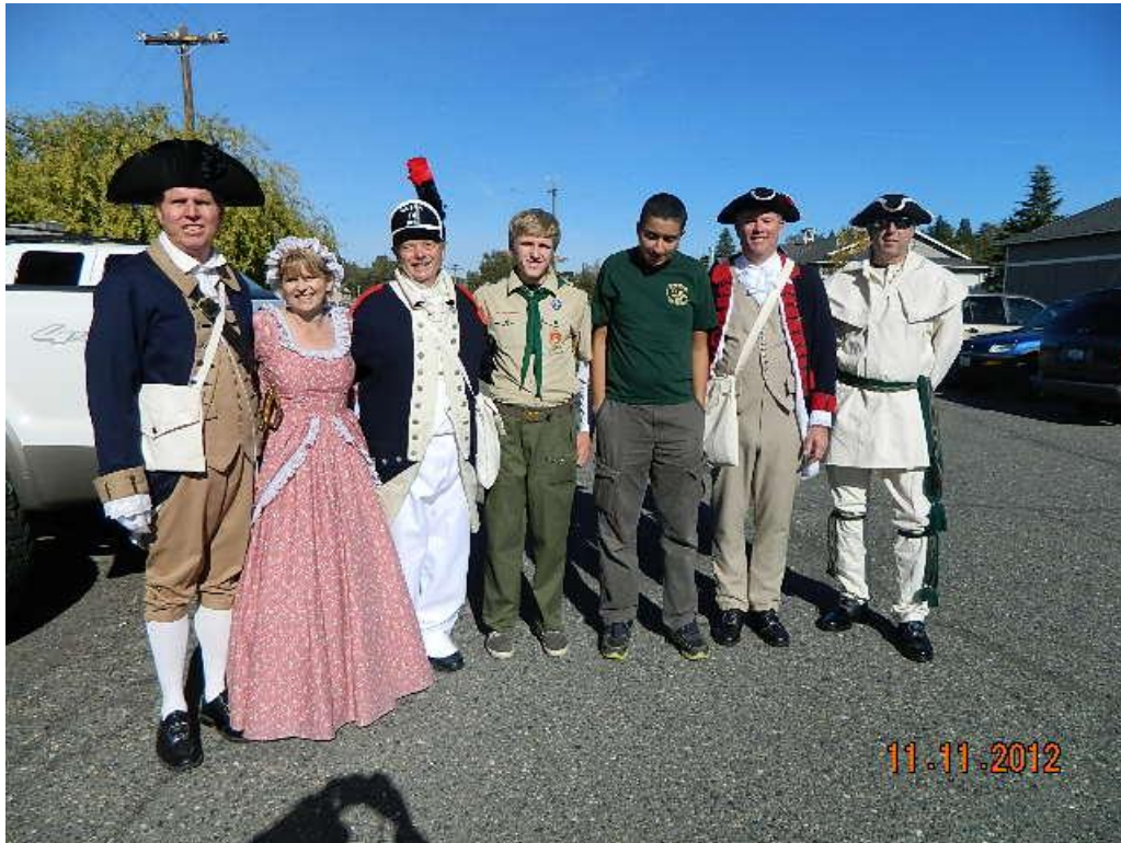
Veterans Day Parade, November 11, 2012