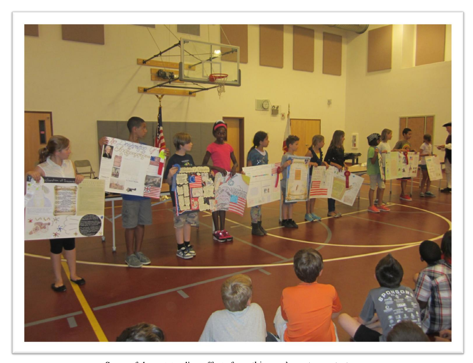
Some of the outstanding efforts from this year's poster contest