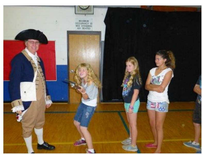
Loomis student ready for battle