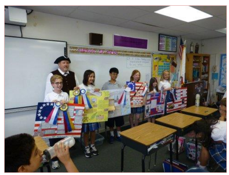
Posters from St. Rose School