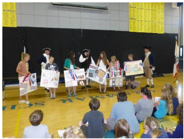
Students receiving ribbons and awards for outstanding posters