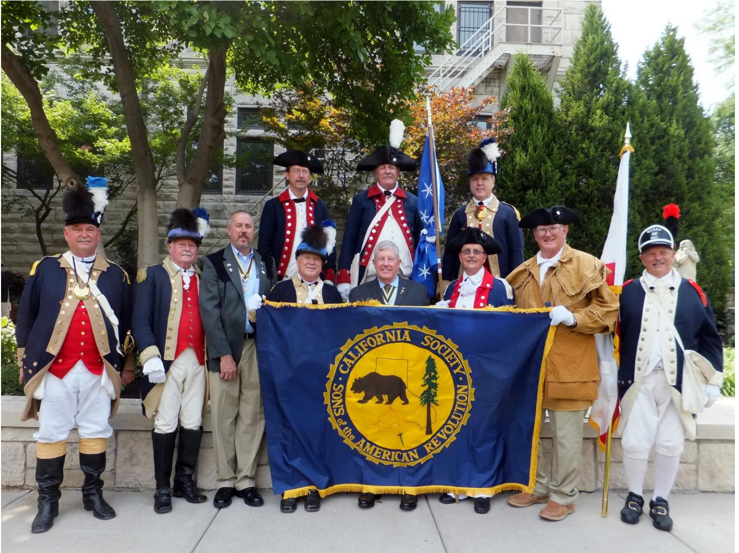
Color Guard, July 7