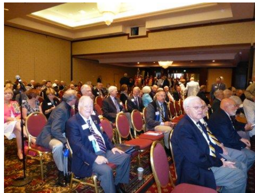
Opening Ceremonies, July 8