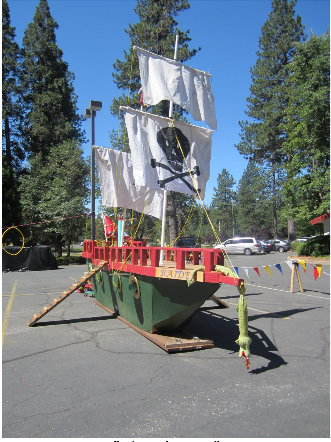
Getting ready to set sail