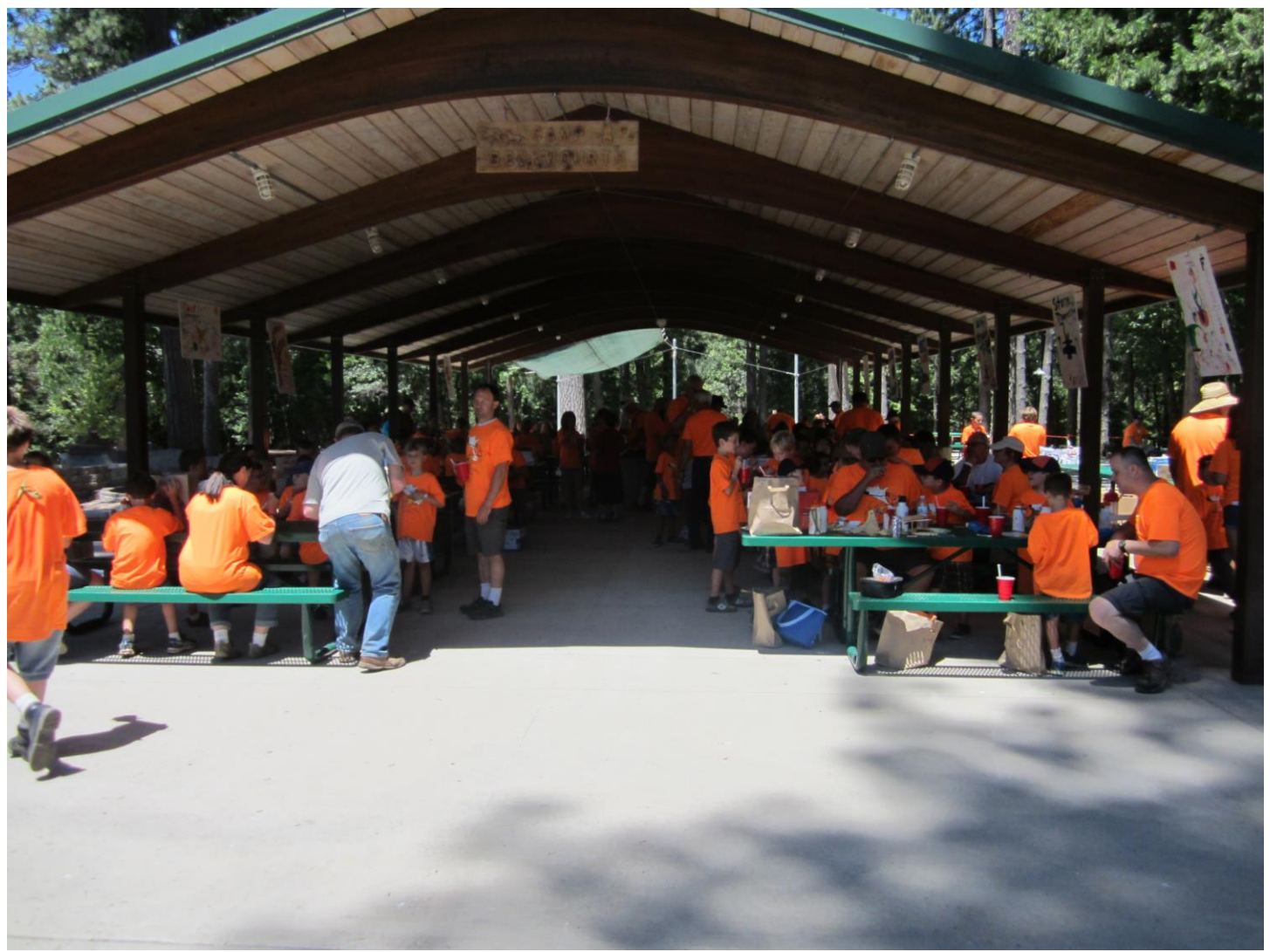
Time for grub

Thanks to all who gave so generously of their time to make this event happen.